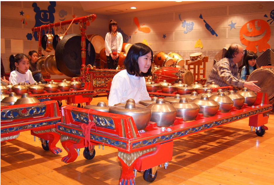
Girls playing bonang. Wheels on the legs make moving easy.