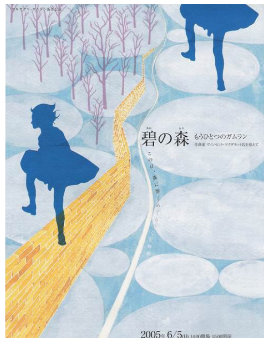
Poster for Blue Forest.

I wrote music for the start and end of the wayang, but asked Marga Sari to compose the srepegan and sampak type pieces, which they did beautifully. The score also called for a six person chorus (women and men, students from a university of the arts) and four solo voices using four vocal styles: Javanese, Buddhist chant, Japanese folk,