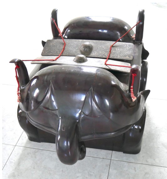
Gong Komodhong, made in the form of an elephant from mahogany frame and pamor keys

"After high school, I wanted to become an actor. I applied to the television department at school, but I was rejected twice. Eventually, I looked and saw that