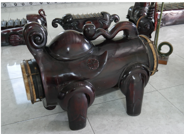
Kendhang ciblon in the form of an elephant

Kris are made from pamor (a distinctive layered metalworking style used to make kris), and hold great