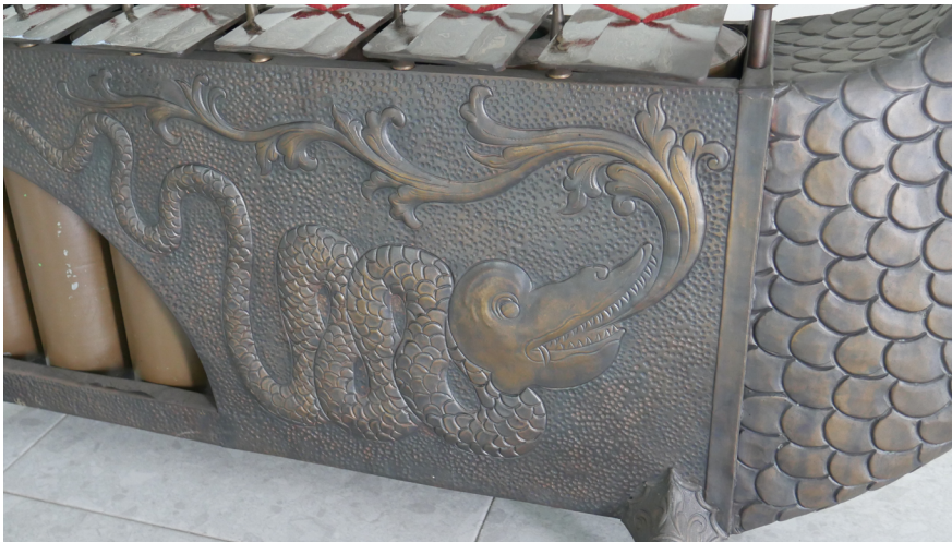
Meticulously hammered details on Sigit's slenthem