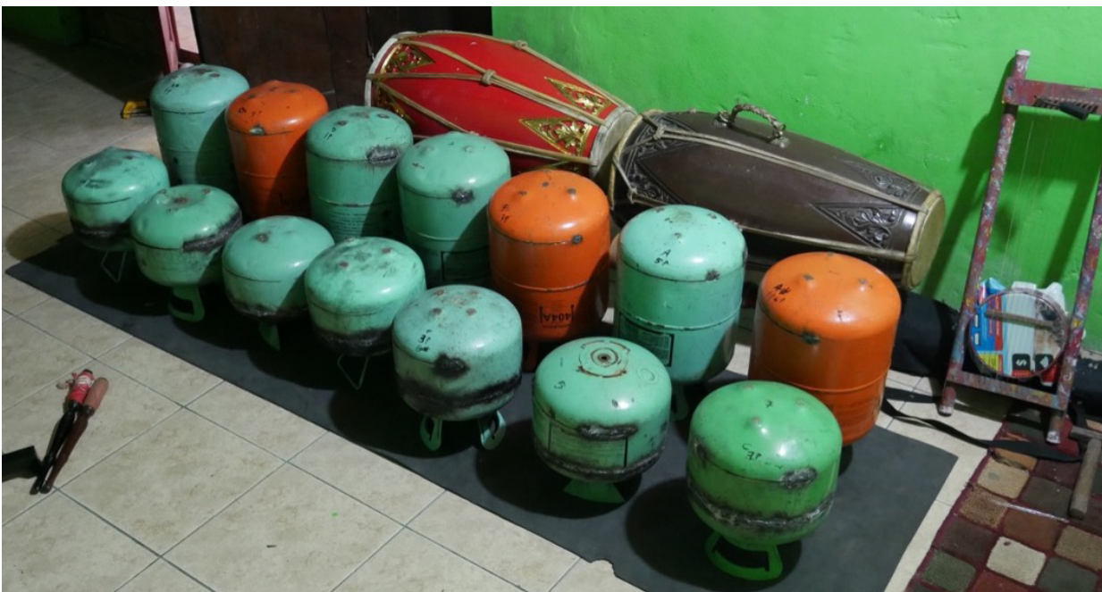
Bonang made from recycled gas tanks

"In traditional wayang, we learn about the relationships humans hold with each other, with nature, and with the Creator. With Wayang Sampah, we continue working with the same concept, focusing on this