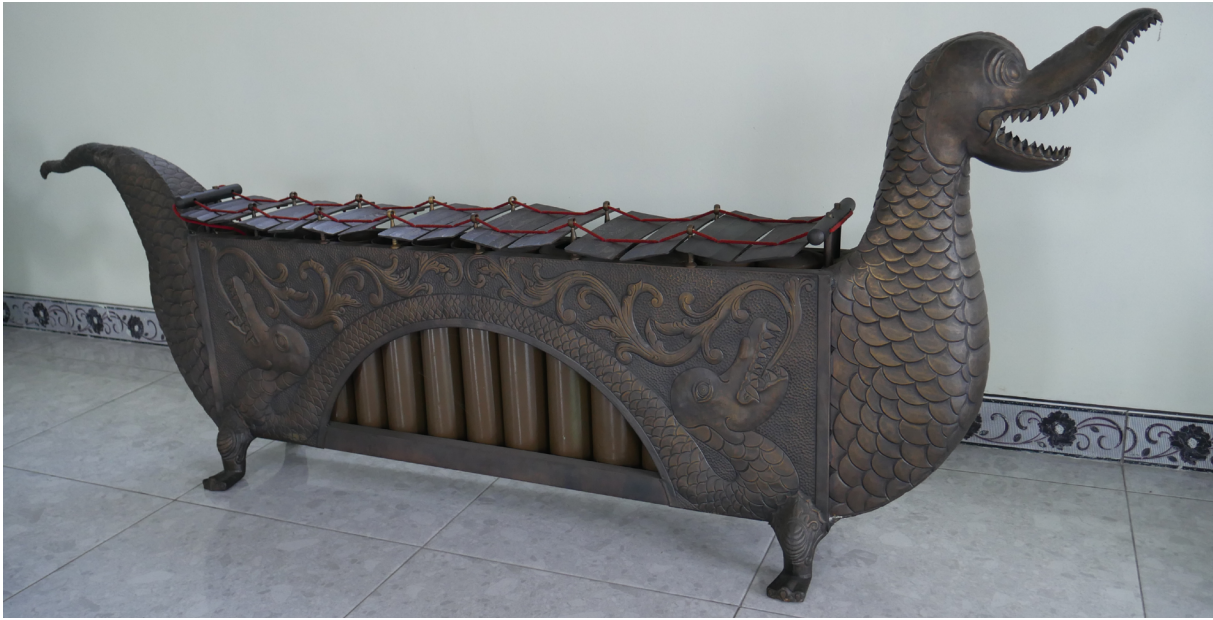
Gender barung in the form of a dragon.