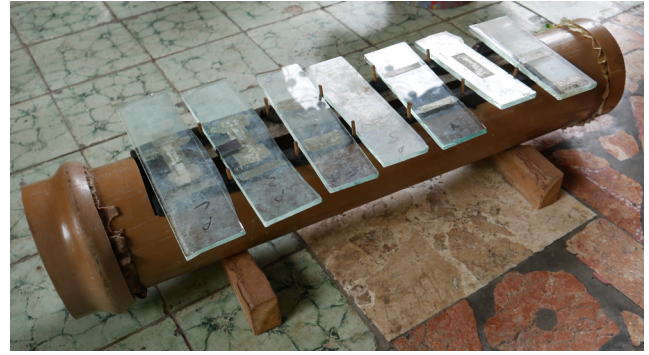
Saron keys made from recycled glass (in progress)

"I want audiences to see what we do with these recycled materials, and inspire them to think