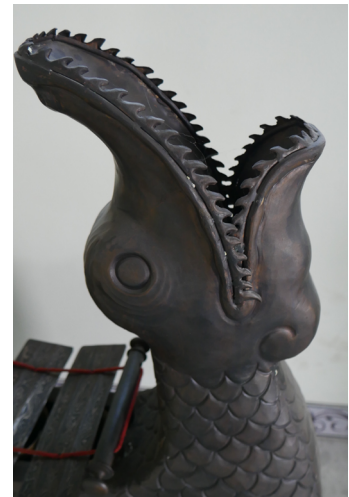
Dragon's head on the gender panerus

is immediately striking. The question almost always follows, "But how does it sound?" According to Mas Sigit, searching for an effective sound was an absolutely critical and inseparable part of the creation.