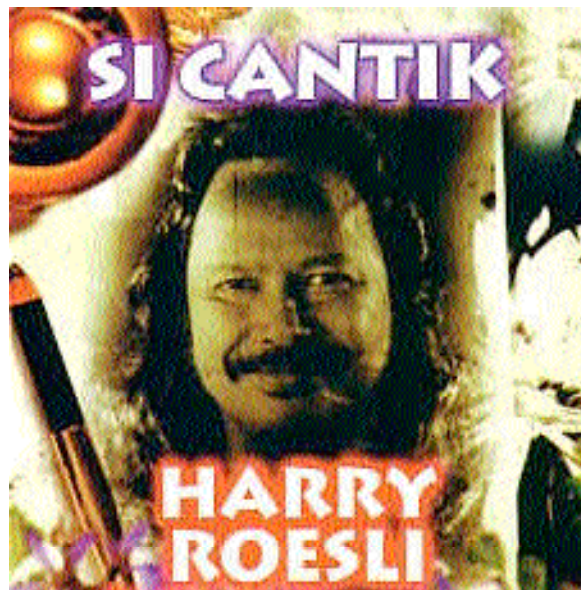
1951 – 2005