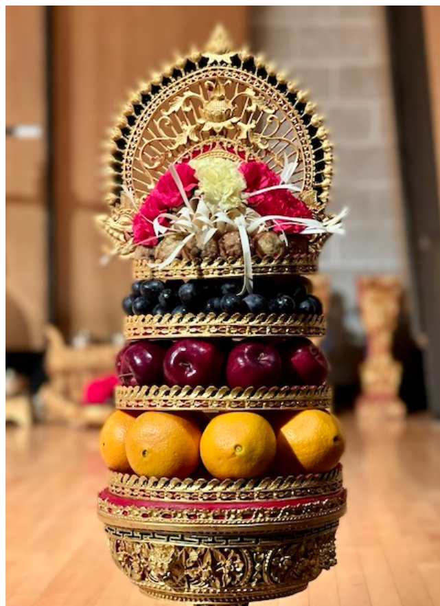
An offering on stage.