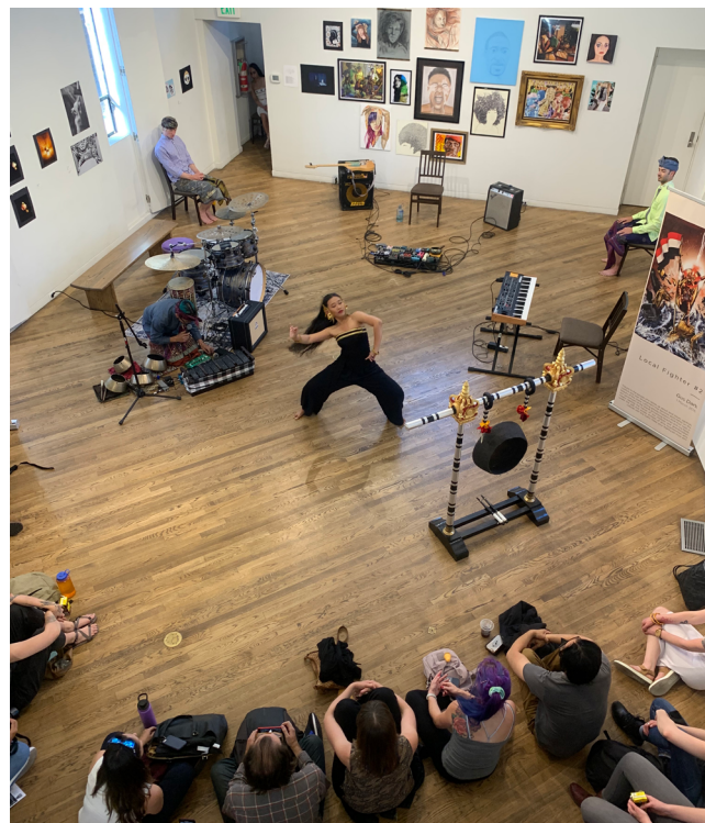
ghOstMiSt's opening performance in MSU Denver's Emmanuel Art Gallery.

Temu Wicara Bali, A Celebration of Balinese Performing Arts . Documentation of the 2013 event hosted by Colorado College: conference schedule, performance programs, and participant bios.