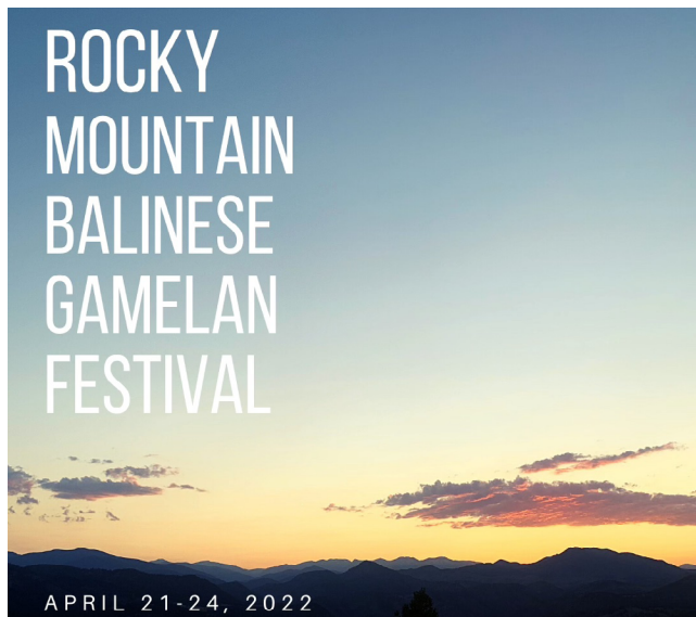
Festival announcement and poster